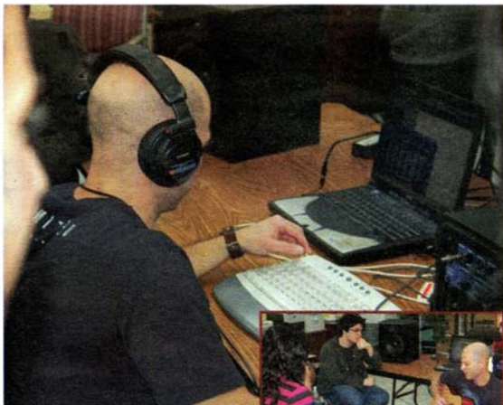
Singles files: Leviatan teaches production by playing MP3s of pop hits.